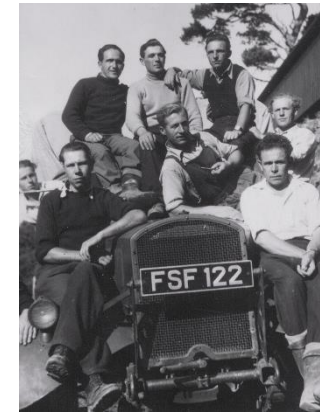
POW camp tractor group