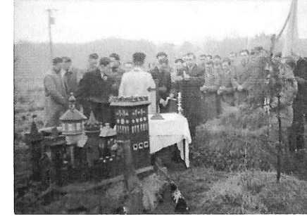
Celebrating Feast of Jordan blessing the Waters 1948