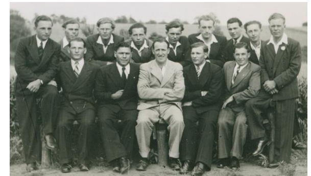
Lockerbie camp chauffeurs with the camp commandant