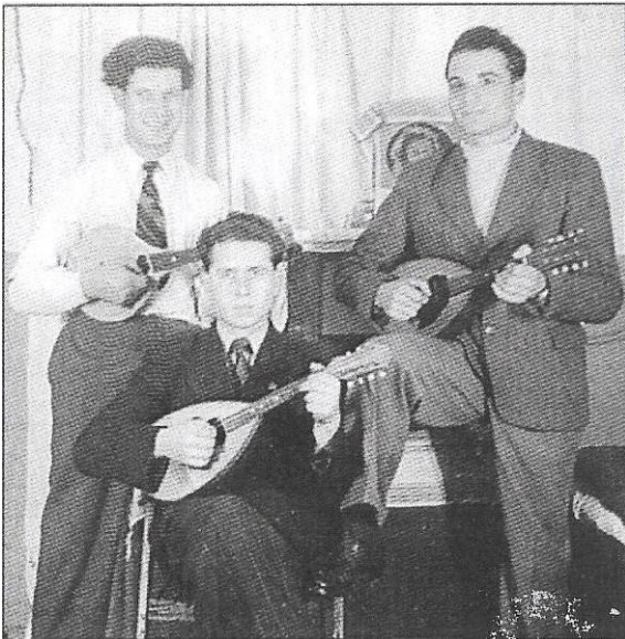
1947 Gala day entertainment provided by the Ukrainian mandolin trio