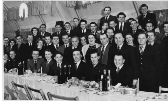
1947 Xmas party Lockerbie POW camp Hallmuir