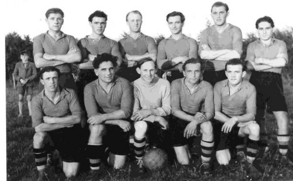
Lockerbie Ukrainian POW camp football team