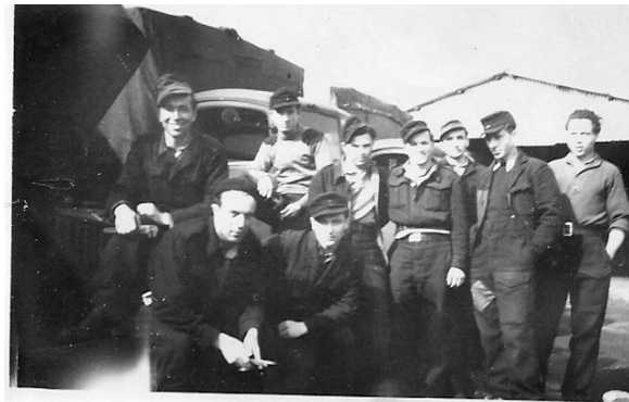
Drivers in Lockerbie POW camp Hallmuir